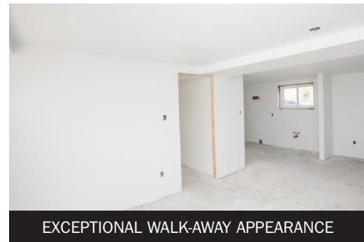
EXCEPTIONAL WALK-AWAY APPEARANCE