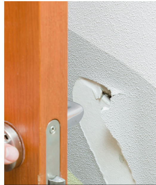
GREAT FOR DRYWALL REPAIR AND TOUCH-UP