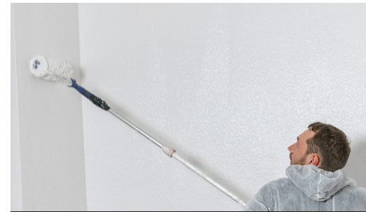
ROLLER FRIENDLY APPLICATION